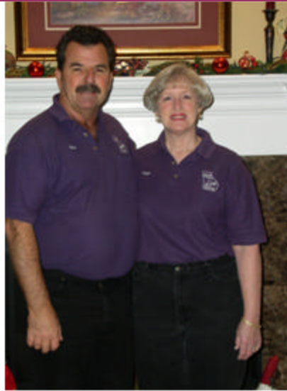
Chapter Director Chatter